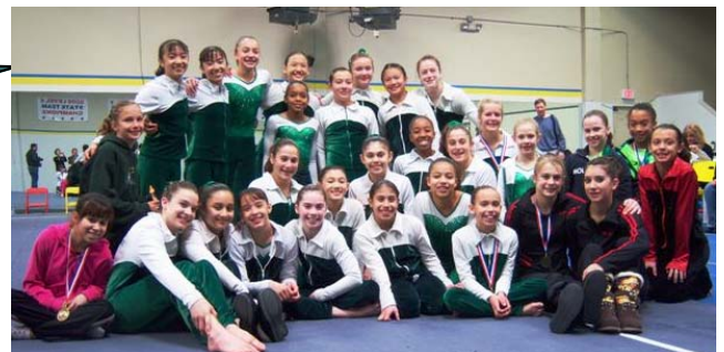
Elite Qualifier and Clinic December, 2008

2009 Level 8-10 Regional Championships will be hosted by Technique Gymnastics at Cal Expo in Sacramento, CA